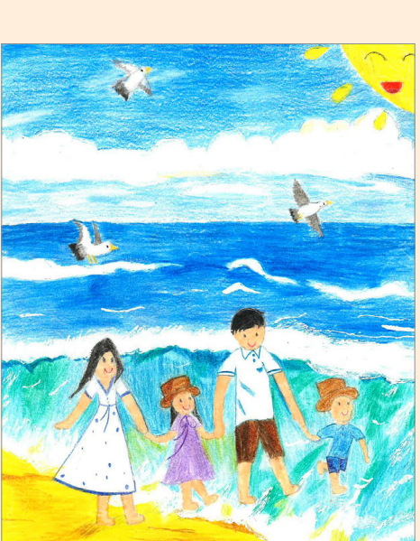
1ST PLACE WINNER GRADES 3 – 5 HANNA